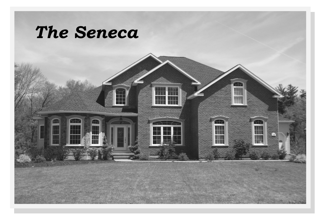
Included Features: Full Masonry Façade as shown, Vinyl Sides and Rear